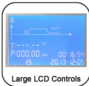
Large LCD Controls