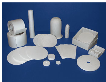
Filters – glass microfiber, cellulose, and membranes

Also available is a full line of high-quality, competitively priced sample preparation products for your QA/QC Laboratory.